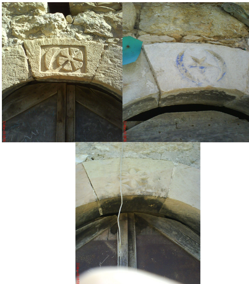
Three typical shapes of hiding the origiinal star of David on the arcs of entrance doors of old houses in southren Mount Hebron

leather, came from the wish that the real T'filin in the possession of the locals will last for a long period of time. The leather straps were wrapped in fabric for their preservation. Throughout the generations, the existence of leather within the fabric was forgotten and it was believed that the straps themselves were made of fabric, as can be observed by superficial examination.