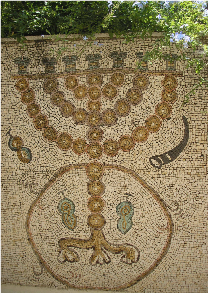
The mosaic floor from the synagogue in Moan, kept today in Yad Ben Zvi, Jerusalem

In the entire cave region in the southern Mount Hebron and in Dura (the biblical Adora'yim ), burial customs are according to Jewish traditions, rather than of Islam. This can be seen through the use of burial caves, preservation of graves, and annual pilgrimages to